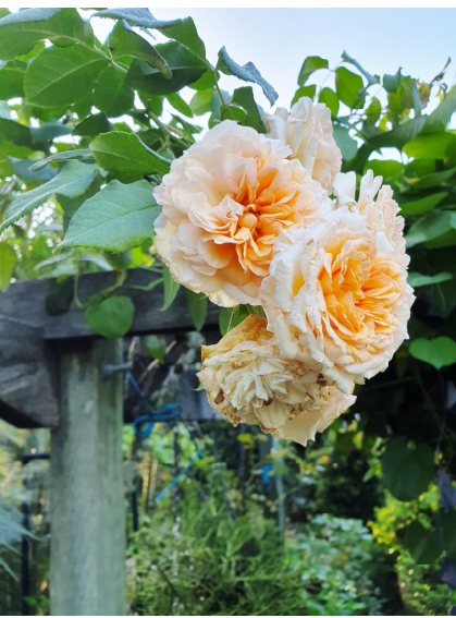
Heritage climbing rose possibly "Buff Beauty"